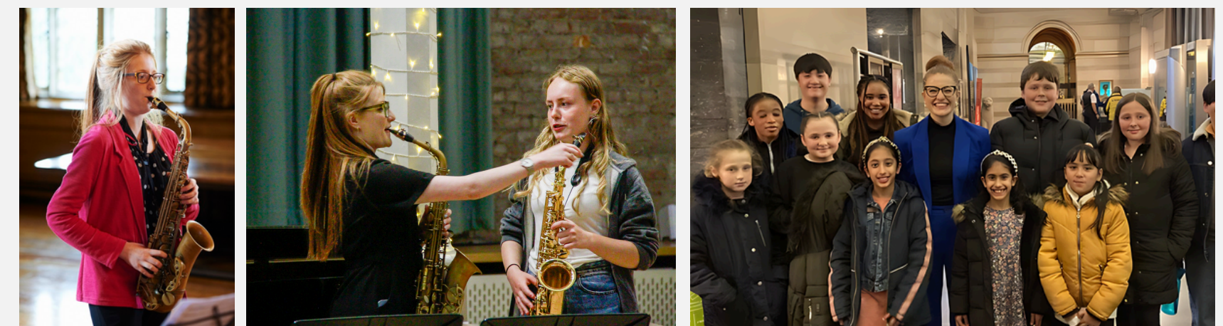
(Left) Jess Gillam as an Award winner in 2013. (Centre) Jess collaborating with an Award winner in 2022. (Right) Jess meeting young musicians on our Connect programme in Sheffield in 2024.